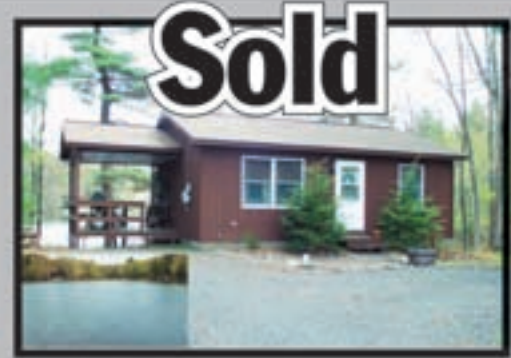
Sold for the Moultons