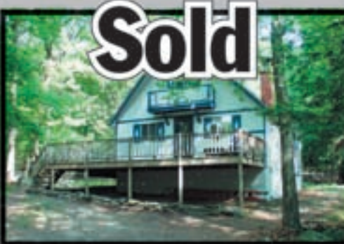
Sold for the Tashliks