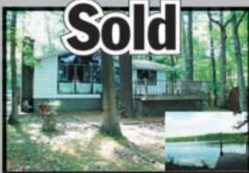
Sold for Steinbergs