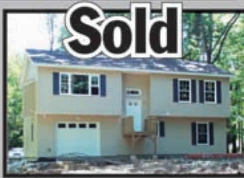
Sold for Eustace & Lane