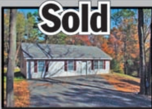
Sold for Chris Von See

570-828-2306 800-634-5964 1506 Route 739 Dingmans Ferry PA 18328 570-296-2342 800-647-4886 Box 1300 Route 6 Milford PA 18337