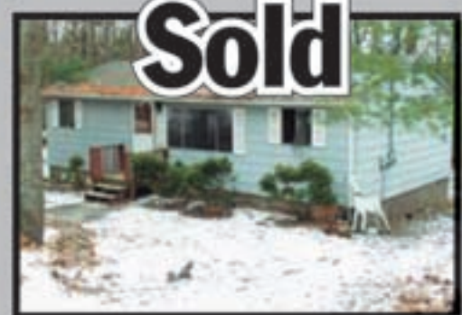
Sold for Chase Bank