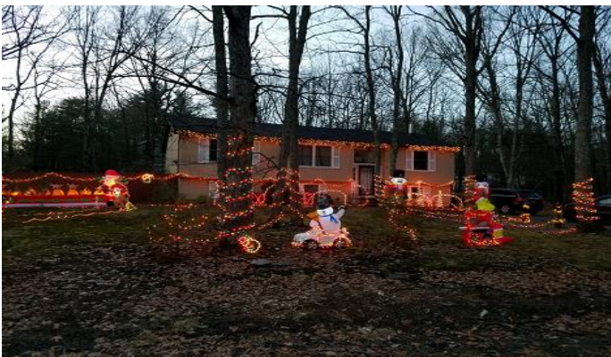
167 Butternut Street