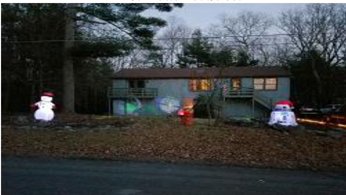
112 East Maheli Drive