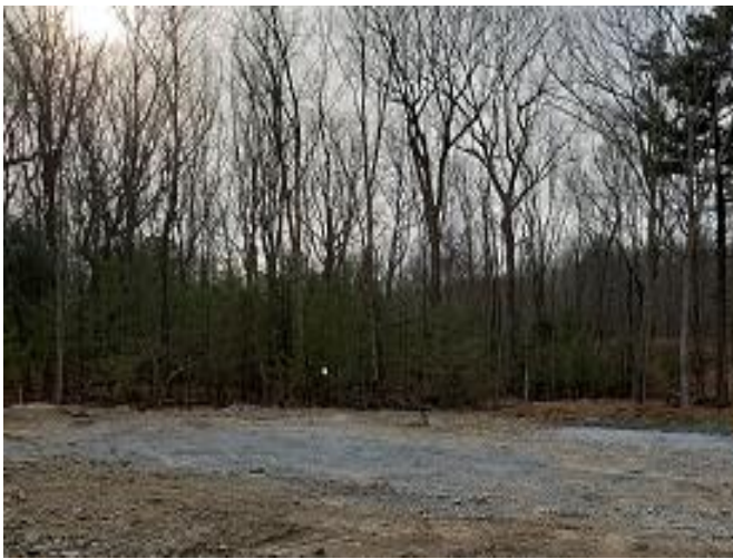
Building Site Cleared

In September 2017 we received our approved conditional use permit and land development plan approvals from the Township. Our Project Engineer was then tasked with developing bid documents and over the course of the winter all portions of the project were sent out for bid proposals. The Board of Directors vigorously reviewed and reviewed all proposals to ensure the best bang for the money. July 2018 the Board of Directors approved Sequoia Tree Service to begin clearing the lot. It was after this that we determined that the site was used at some point during the history of the Association to dump material and this debris will need to be removed and replaced with clean fill material as well as much of the site was rock and or ledge and we would need to have a tremendous amount of rock hammering; Sequoia Services was awarded the site work and site preparation. Pioneer Building Company was awarded the Building Construction. Required building permits from Delaware Township have been secured. Below are some photos of the site prepared for construction of the building. Weather permitting the building construction is expected to start during February 2019.