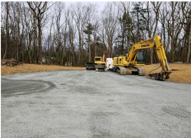
Storage Facility Site Cleared