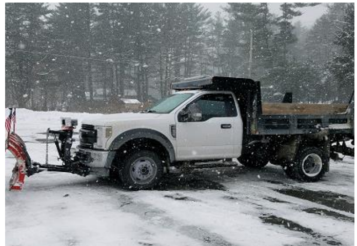
BLCA - New 2018 Ford F450