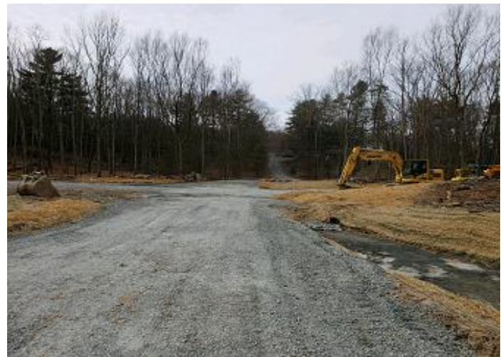
Intersection of Evergreen Drive & Rock Road