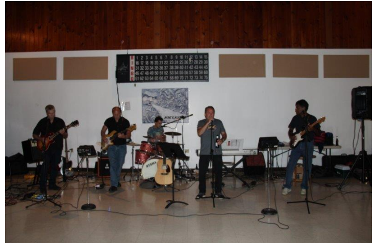
Fun night of Music & Dancing